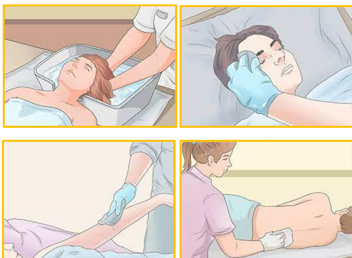
Fig. 1: hospital bed bathing procedure examples

DECURA TOTAL BODY is dermatologically tested and generally well tolerated. Contraindicated only in cases of individual hypersensitivity to one or more components of the product. For external use. Do not swallow.